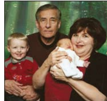
BIG ON FAMILY