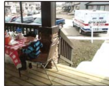
BIG ON COMMUNITY