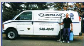
Professional Truck-Mounted Carpet & Upholstery Cleaning