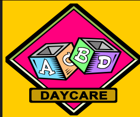
DAYCARE FOR SALE! Established daycare is owner operated and functioning at full capacity. On 2 lots and zoned P-2 $649,900