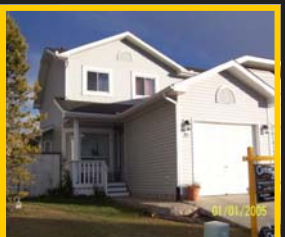
EDGEWATER Wonderful 3 BR home with att garage. Awesome features & tremendous value for the dollar! $314,900