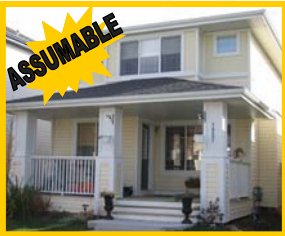
SAGEWOOD 1421 sf Jayman built. Hardwood floors and MUCH more! Open concept home on a choice lot! $355,900