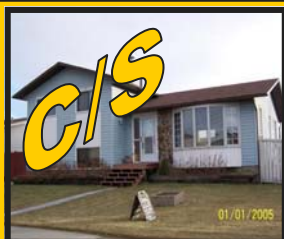
EDGEWATER Spacious walk-up 4 lvl split. 4 BR's / 3 baths, 26X28 garage on large lot backing green space. $354,900