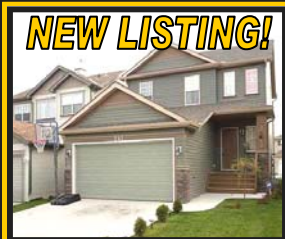
SAGEWOOD 4 BDRM / 4 BATH home with over 2500 sf dev. Area! Two hot water tanks, RV parking & more! $419,900