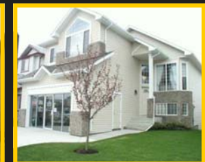
THORBURN Former Layne showhome will satisfy the most discerning buyer. Over 2300 sf dev area. $529,900