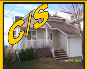
JENSEN Awesome 2BR end unit boasts a bright floor plan. Fully dev, insulated garage and more! $287,900