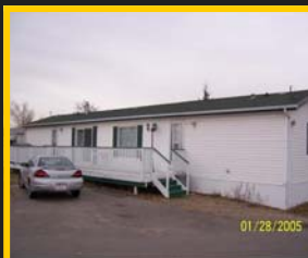
OLD TOWN Affordable!! Newer 3 BR mobile on rented lot. Immaculate inside and out! $142,000