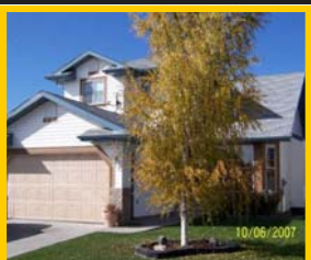
MEADOWBROOK Welcome Home! Over 1900 sf of awesome floor to ceiling appeal! Prime location! $434,900