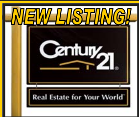
AIRDRIE MEADOWS 1170 sqft. Bi-level with part dev basement (suite possibilities!!). Numerous updates. $331,900