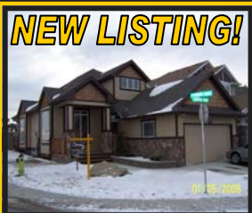
COOPERS CROSSING Wonderfully appointed and highly functional! Over 2850 SqFt dev area. TONS of upgrades $549,900