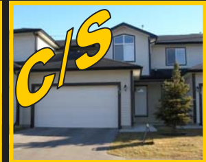
THE CANALS Sparkling 3BR condo features O/S Dbl garage, gas FP, vaulted ceiling in MBR, and much MORE! $299,800