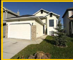
THORBURN Backs onto path, stunning view of lake from the deck. Over 2100 sf awesome living area. $419,900