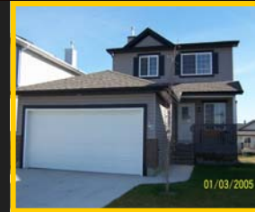
THE CANALS Fully dev 4 BR's / 4 baths. W/O bsmt with in-floor heat. Quiet cul-de-sac and backs onto path! $420,000