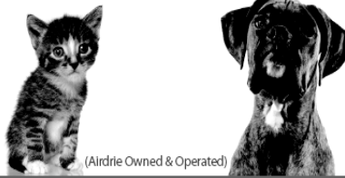
(Airdrie Owned & Operated)